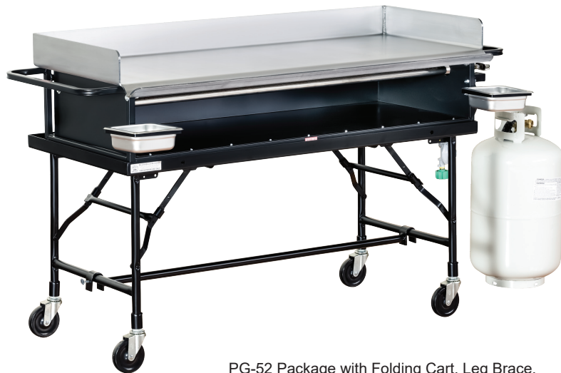
PG-52 Package with Folding Cart, Leg Brace, & 30 lb. Propane Tank