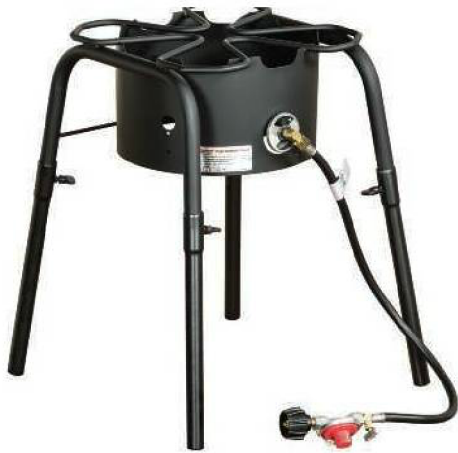
SH140L Pot Cooker with 60,000 Btu burner