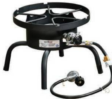
SL30L Pot Cooker with 30,000 Btu burner