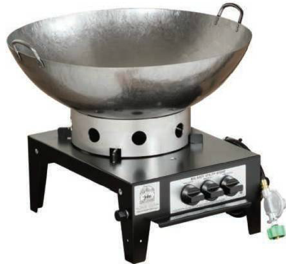
26" Wok Set set includes wok, stainless steel ring & aluminum lid (not shown) (Big 60 I Utility Stove sold separately)