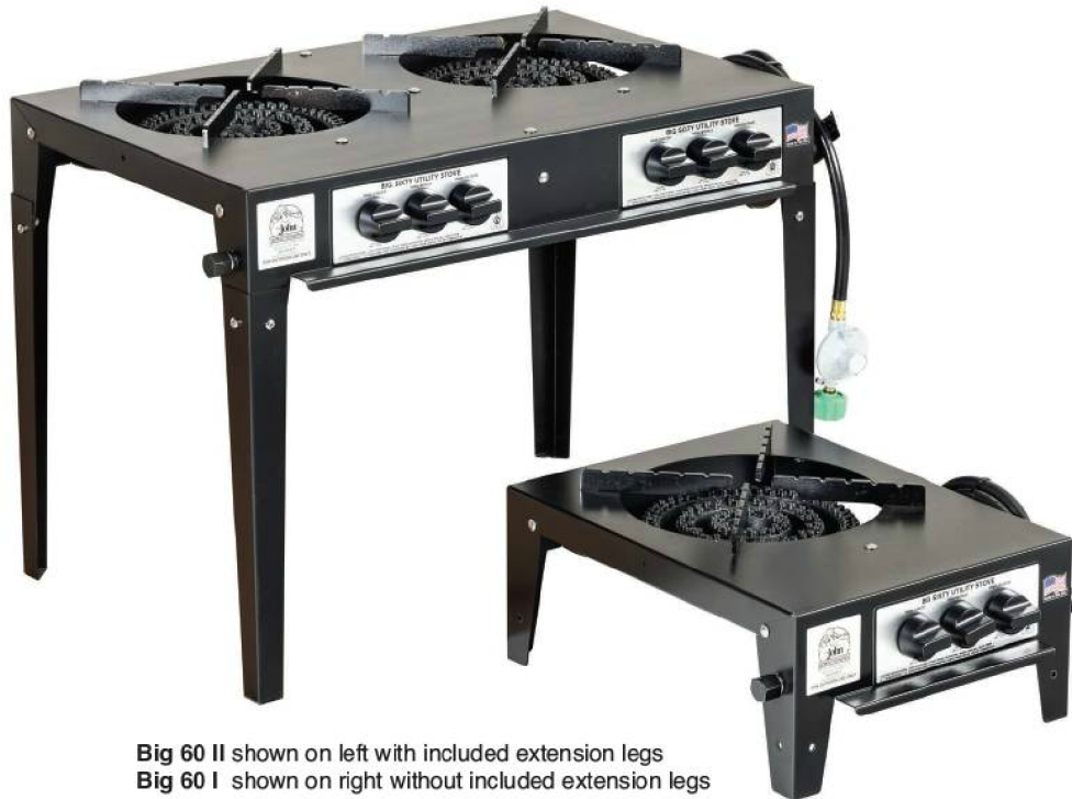
Big 60 II shown on left with included extension legs Big 60 I shown on right without included extension legs