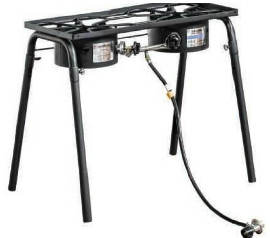
EX-60LW Double Burner Pot Cooker with 2 - 30,000 Btu Burners