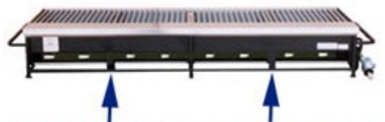
Drip Tray Locks Attach Here on 4 Section Grills