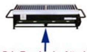
Drip Tray Locks Attach Here on 2 Section Grills