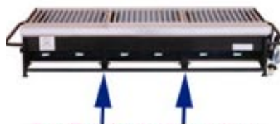
Drip Tray Locks Attach Here on 3 Section Grills