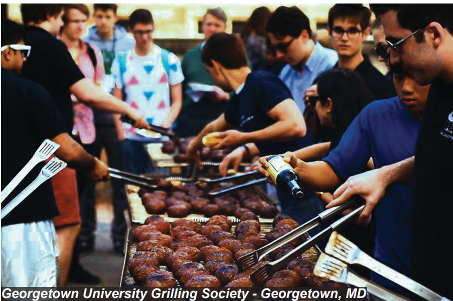
Georgetown University Grilling Society - Georgetown, MD

The ease of use combined with the opportunity to serve 300+ burgers every Friday are some things we love about Big John. The smell of charcoal burning and beef cooking matched with the sounds of laughter and classic rock are what make Every Friday so special for us here at Georgetown. We would not be able to continue this 16 year tradition of serving delicious burgers every week if it were not for Big John Grills. We love our Big John grills. We look forward to ordering many more grills in the future. - Georgetown Univ. Grilling Society